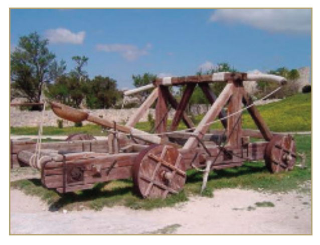
A Trebuchet – throws rocks fast and high