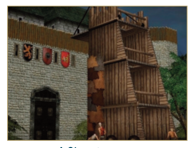
A Siege tower