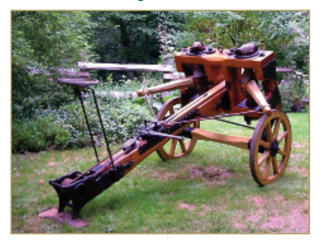
A Ballista - type of Crossbow