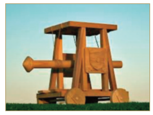
Large Battering Rams