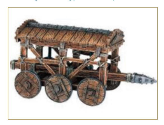
Small Battering Rams