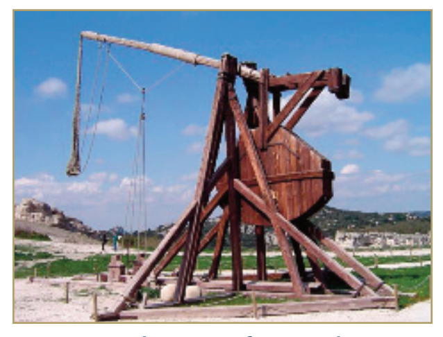
A Mangonel – type of catapult